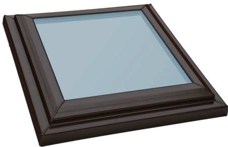
Curb Mount (ICMG)

Kennedy Skylights manufactures high performing, quality glass skylights in both curb or deck mount models to accommodate all roof pitches and roofing systems. Our Impact Glass Series features a severe weather, hurricane glass.